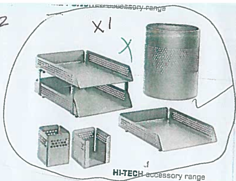
HI-TECH accessory range